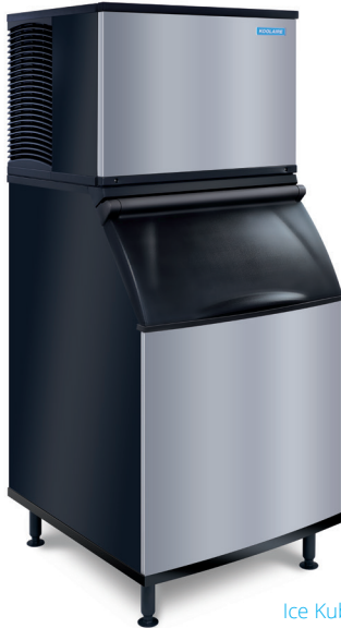
Koolaire KT-0500 Ice Kube Machine on K570 Bin

Koolaire by Manitowoc ice machines are designed, developed and tested by Manitowoc engineers to provide great ice production, energy efficiency and reliable service at an affordable price.